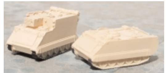
Production models of the M577 and M113.

This prototype photo shows the lettering on the flat car and the tie-downs for the load.